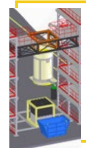
Simulation of graphite retrieval of Chinon A2 and tests to be performed in the industrial demonstrator